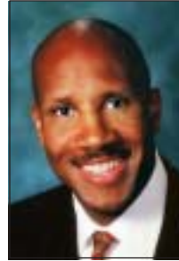
COMMISSIONER Art Graham